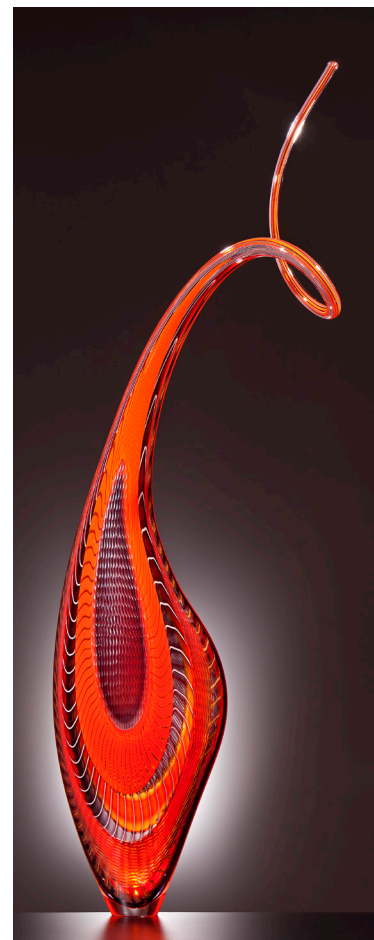
Lino Tagliapietra Dinosaur , 2011

The Glass Studio offers classes in flameworking and fusing. See our schedule of classes for details.