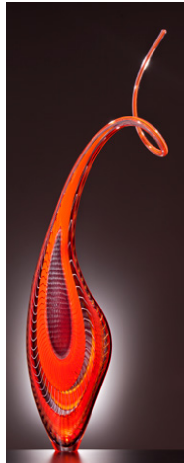
Lino Tagliapietra Dinosaur , 2011

The Glass Studio offers classes in flameworking and fusing. See our schedule of classes for details.