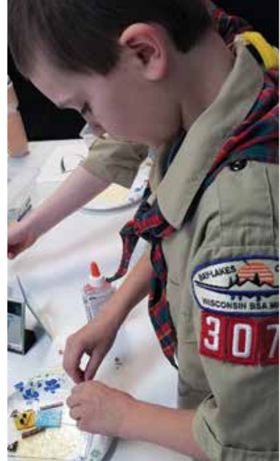
WEBELOS cap an art adventure with a self portrait in glass.

Once each month during the school year Girl Scouts and Cub Scouts view the museum and create a sun catcher in The Glass Studio. Twice per year the museum offers a pin-earning opportunity known as the Art Explosion Adventure. WEBELOS tour the museum, make art with a variety of media and create a fused-glass project in The Glass Studio.