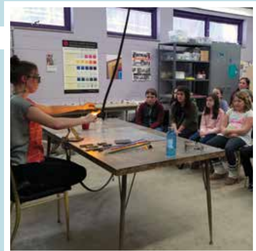
Montessori students watch flameworking demonstrations to connect the science of glass with art.

Students from kindergarten through sixth grade visited the museum several times between the months of October and March for grade level appropriate tours, flameworking demonstrations, and glass-making activities.